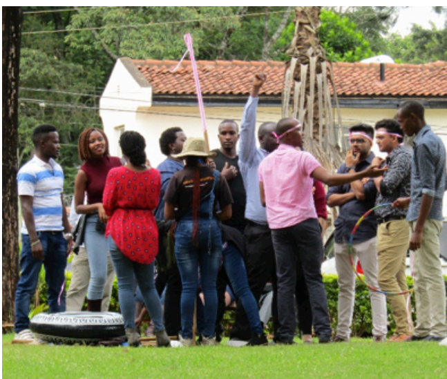
Team Pink deliberating on their winning strategy

It was also an incredible time to appreciate and award members of staff who have served the firm for 20 or more years.