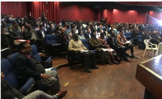
2019 budget seminar at the Oshwal Community Center

Also prior to the budget seminar, Nairobi office held a CEOs' pre-budget briefing where we shared our expectations of the budget and we also sought comments with a view to presenting the same to The National Treasury.