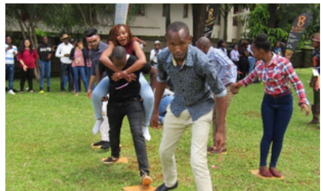
Team building activities during the Nairobi office Christmas party