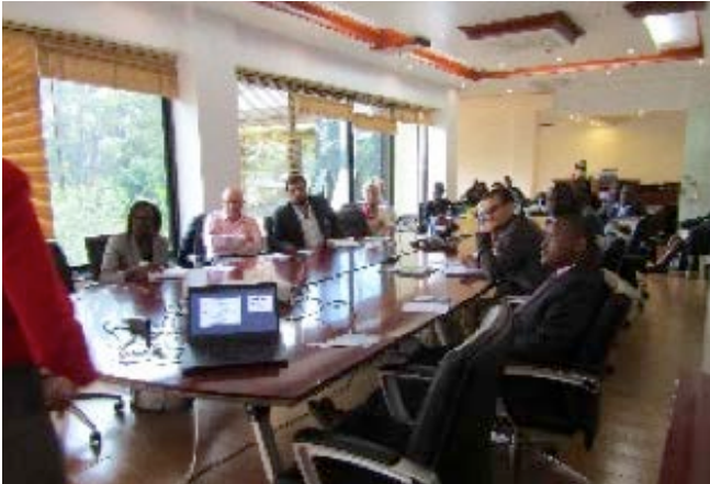
The French Chambers breakfast session

Our teams shared our global expertise during the French Chamber of Commerce and the Standard Chartered Bank China Desk breakfast sessions. The breakfast sessions focus areas were, general tax compliance, dispute resolution, available tax incentives, and the recent tax developments.