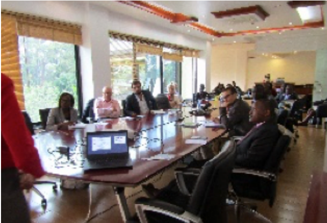
The French Chambers breakfast session

Our teams shared our global expertise during the French Chamber of Commerce and the Standard Chartered Bank China Desk breakfast sessions. The breakfast sessions focus areas were, general tax compliance, dispute resolution, available tax incentives, and the recent tax developments.