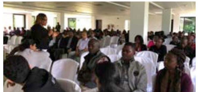
Training session during the health camp