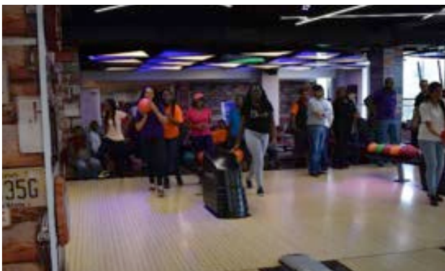
PKF staff at the village market bowling alley

Teamwork is an entrenched value amongst all PKF member firms which enable us to work seamlessly and enhance client relationships. This year, all PKF Nairobi office staff downed their tools and picked some pins for the PKF bowling day. In teams of 8, staff demonstrated and enhanced their ability to work together and also build interpersonal relationships.