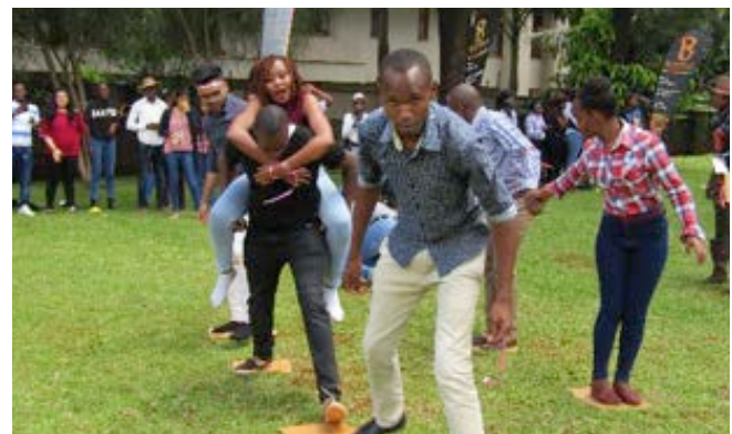
Team building activities during the Nairobi office Christmas party