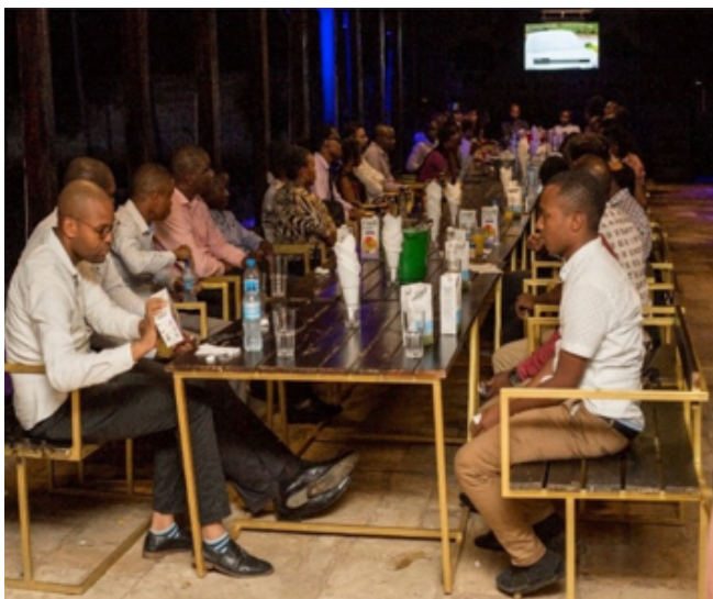
PKF Tanzania team during the christmas dinners