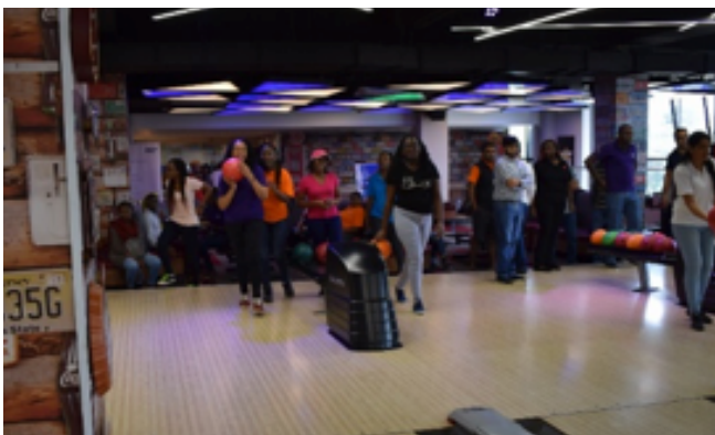
PKF staff at the village market bowling alley

Teamwork is an entrenched value amongst all PKF member firms which enable us to work seamlessly and enhance client relationships. This year, all PKF Nairobi office staff downed their tools and picked some pins for the PKF bowling day. In teams of 8, staff demonstrated and enhanced their ability to work together and also build interpersonal relationships.