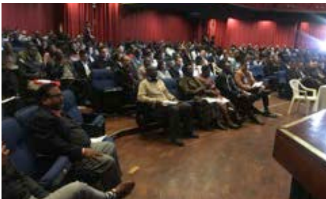
2019 budget seminar at the Oshwal Community Center

Also prior to the budget seminar, Nairobi office held a CEOs' pre-budget briefing where we shared our expectations of the budget and we also sought comments with a view to presenting the same to The National Treasury.