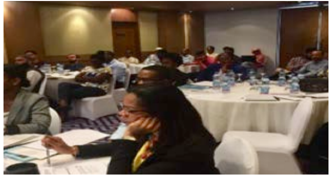
Tanzania Tax and IFRS 16 seminar which took place on 23 August 2019 at New Africa Hotel Dar es Salaam