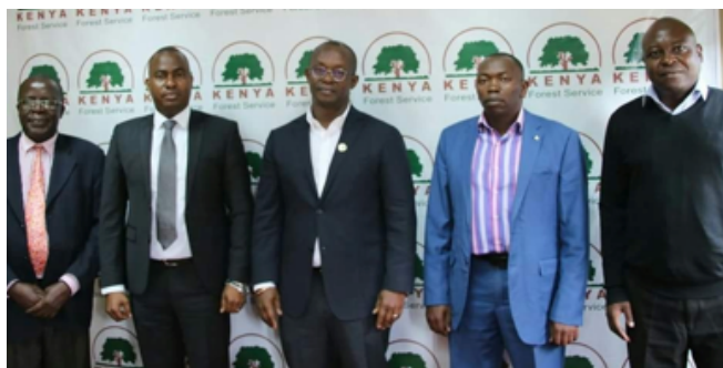
KFS delegation with PKF team during the trees for life initiative deliberations

PKF and KFS held discussions on how the two institutions will work together to make the Trees for Life initiative come to fruition. It was resolved that KFS will provide technical expertise in forestry activities and logistical support while PKF offer support through funding, creating awareness about individual responsibility in environment conservation.