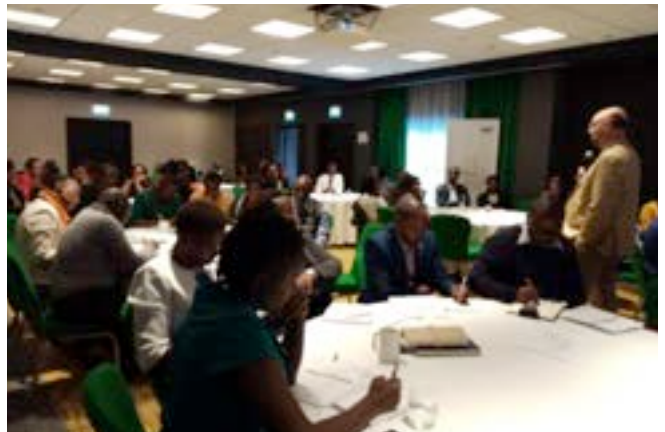
2019 NGO seminar