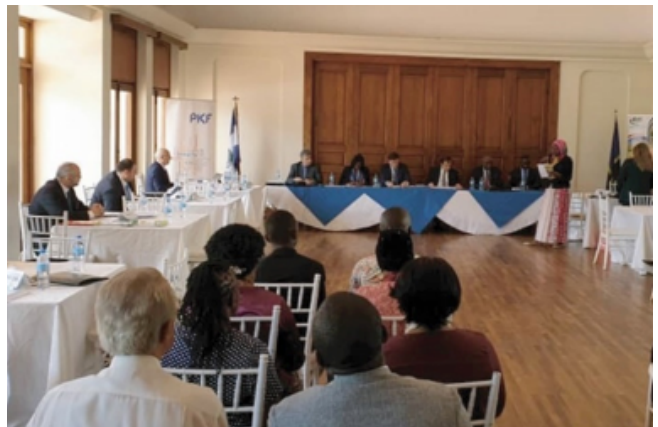
The Tax, Audit, and Legal Training for Greece Investors meeting.