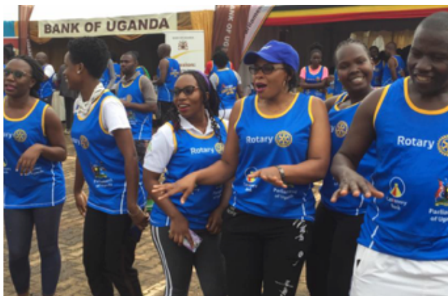
Kampala Office staff during the Rotary Cancer Run