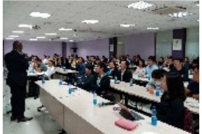
China Desk breakfast session