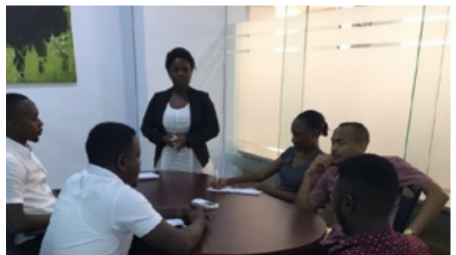
Dar es Salaam team during a Friday Talk

To enhance teamwork and service delivery, PKF Tanzania has designated every Friday for 'morning talk' programs. The morning talk facilitates team building and soft skills training, as well as stay up to date with our core values.