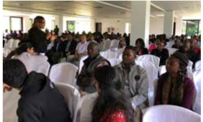
PKF staff during the 2019 Health Camp Day

At PKF, we have embedded the health and well-being of our employees to our business strategy. Our people are the greatest asset that we have and we recognize that a healthy, happy and committed workforce is vital to the firm's success. The firm brought in experts from Metropolis Healthcare Limited and Faraja Cancer Support Trust. The teams focused on mental health and healthy living habits. Staff also benefited from free general medical check-up.