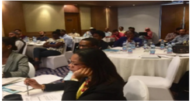
Tanzania Tax and IFRS 16 seminar which took place on 23 August 2019 at New Africa Hotel Dar es Salaam