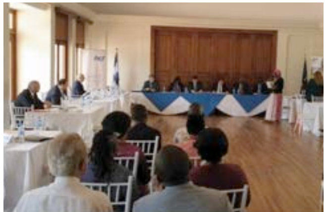
The Tax, Audit, and Legal Training for Greece Investors meeting.