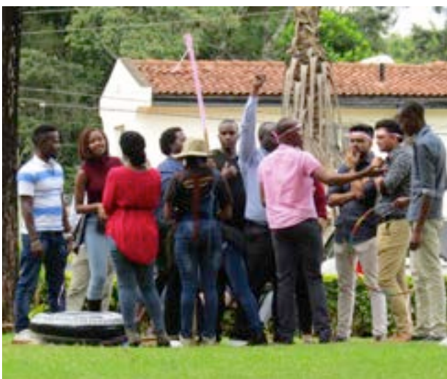
Team Pink deliberating on their winning strategy

It was also an incredible time to appreciate and award members of staff who have served the firm for 20 or more years.