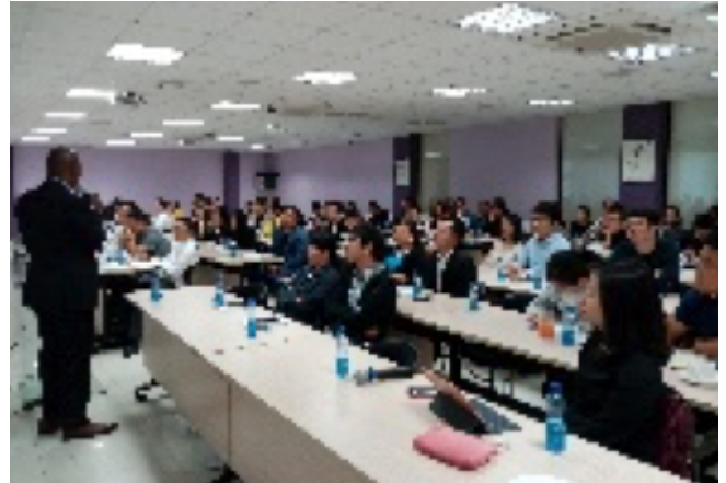
China Desk breakfast session