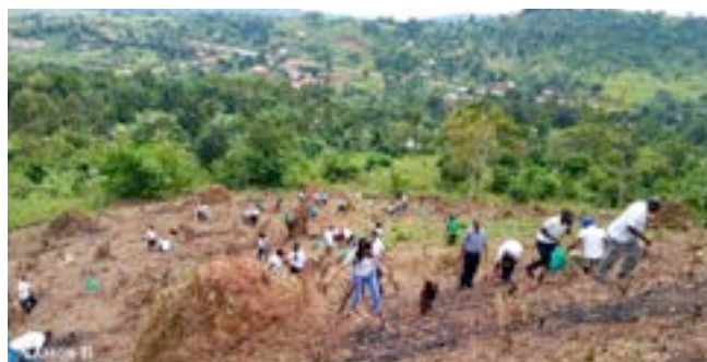
Uganda office staff planting trees at Bubuule Hill in Mpambire