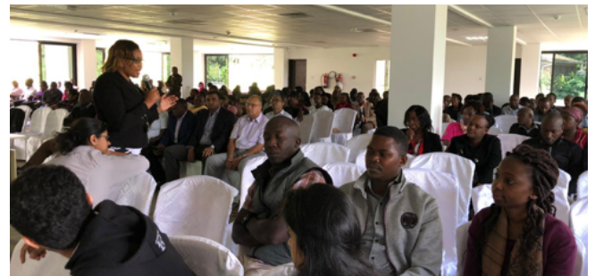
Training session during the health camp