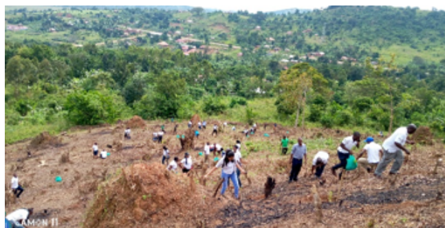
Uganda office staff planting trees at Bubuule Hill in Mpambire