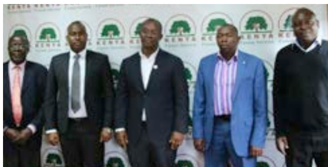
KFS delegation with PKF team during the trees for life initiative deliberations

PKF and KFS held discussions on how the two institutions will work together to make the Trees for Life initiative come to fruition. It was resolved that KFS will provide technical expertise in forestry activities and logistical support while PKF offer support through funding, creating awareness about individual responsibility in environment conservation.