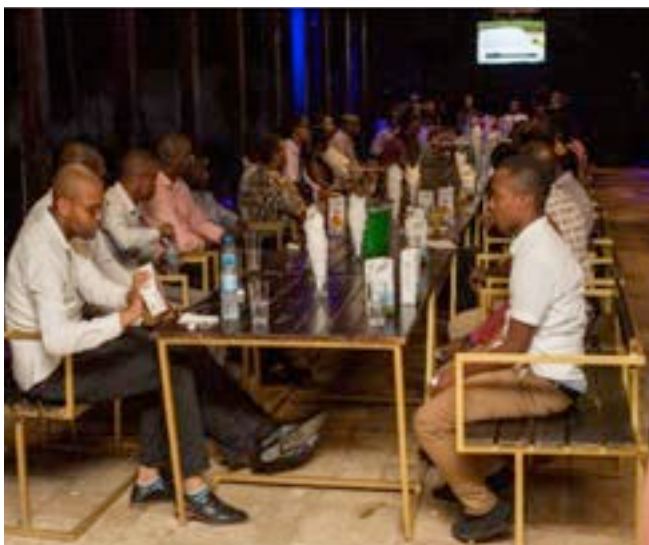
PKF Tanzania team during the christmas dinners