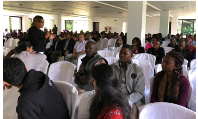
PKF staff during the 2019 Health Camp Day

At PKF, we have embedded the health and well-being of our employees to our business strategy. Our people are the greatest asset that we have and we recognize that a healthy, happy and committed workforce is vital to the firm's success. The firm brought in experts from Metropolis Healthcare Limited and Faraja Cancer Support Trust. The teams focused on mental health and healthy living habits. Staff also benefited from free general medical check-up.