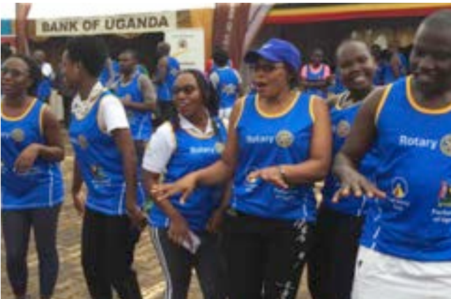
Kampala Office staff during the Rotary Cancer Run