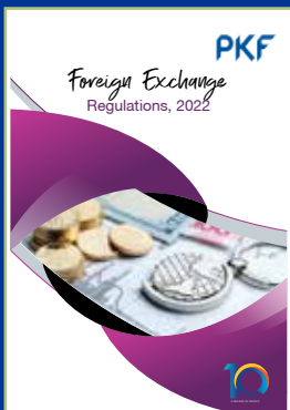
Forex Regulations 2022

Click on the below Publications and updates that you may be interested with