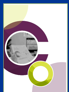
Finance Act Brief 2022-2023