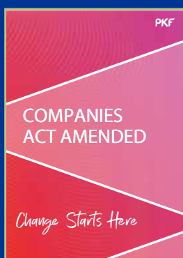
Amendment on the Companies Act, 2022